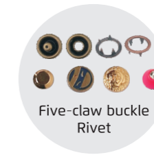
Five-claw buckle Rivet